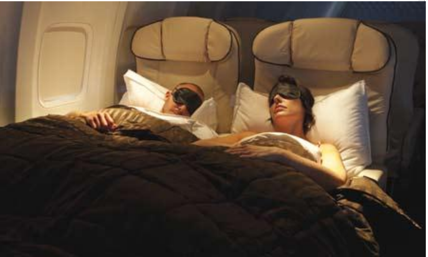
Forward Cabin Berthable Seats