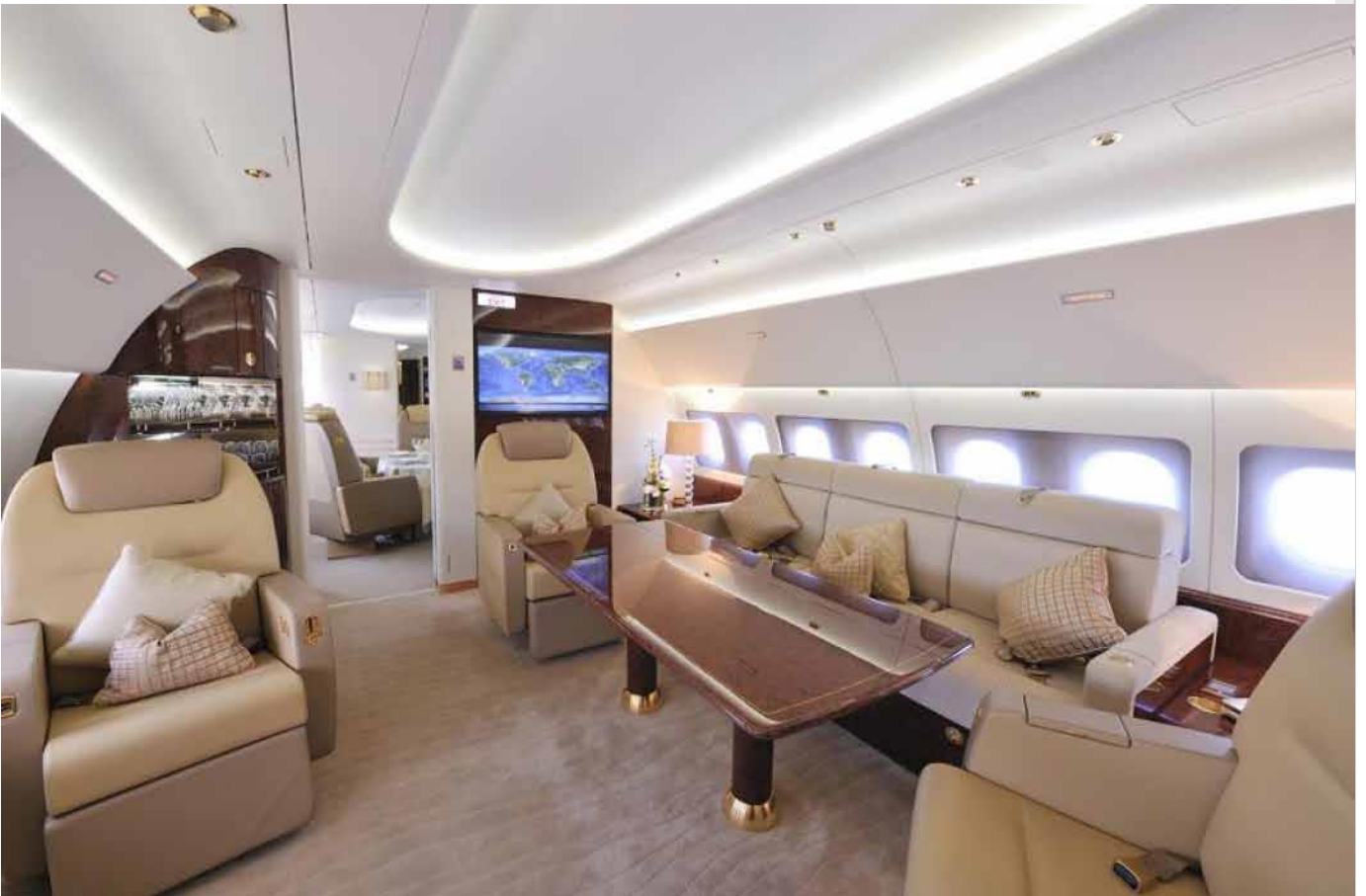
Aft Lounge with Convertible Beds