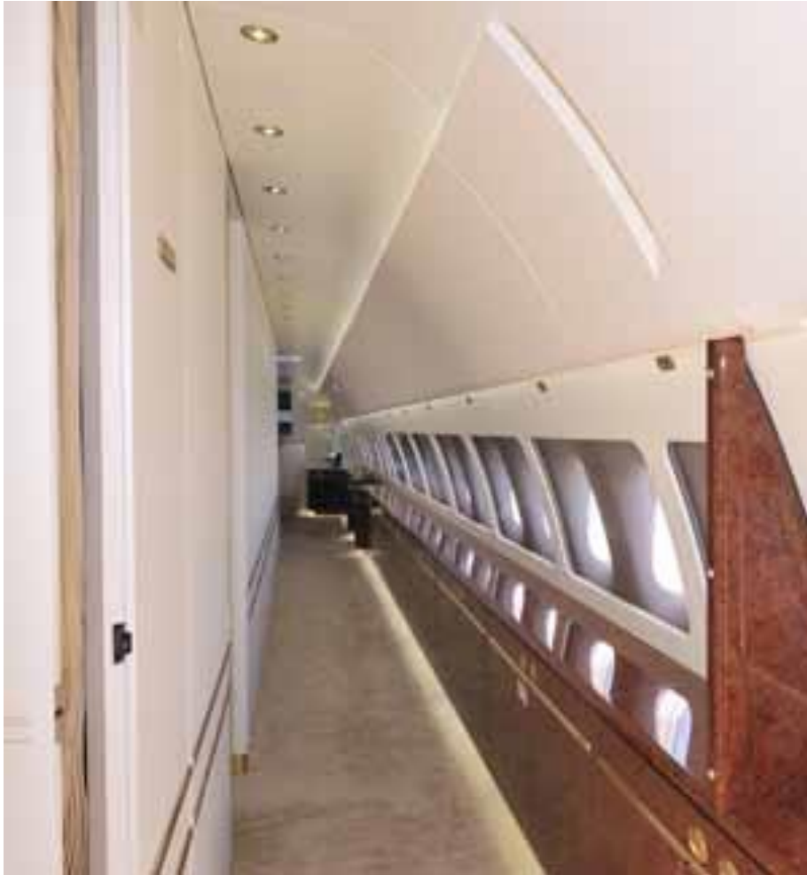
Side Hall Leading from Forward to Aft