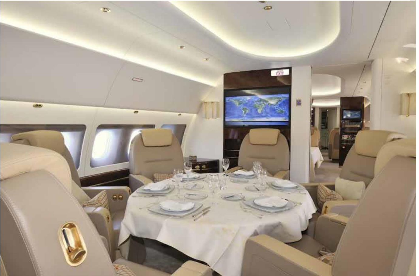
Six Place Conference/Dining Table