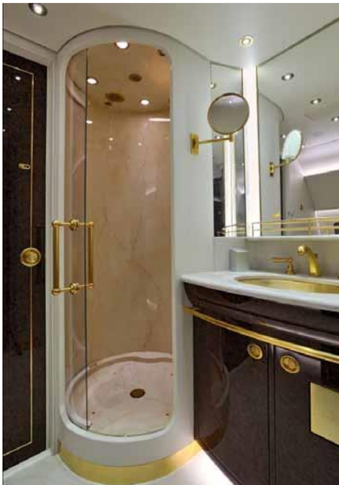
Executive Lavatory Shower