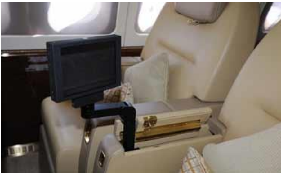
Seat with Monitor Detail