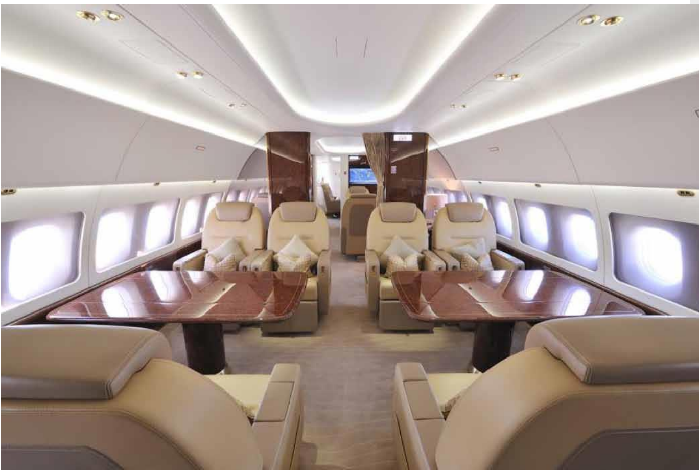
Aft First Class Seating with Convertible Beds