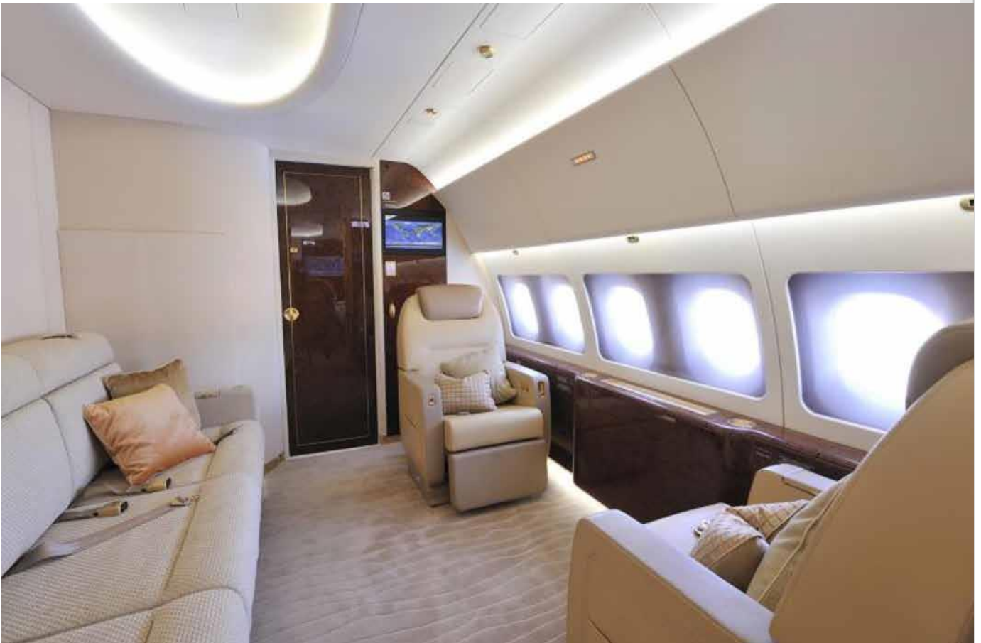
Forward Executive Lounge Area with Convertible Beds