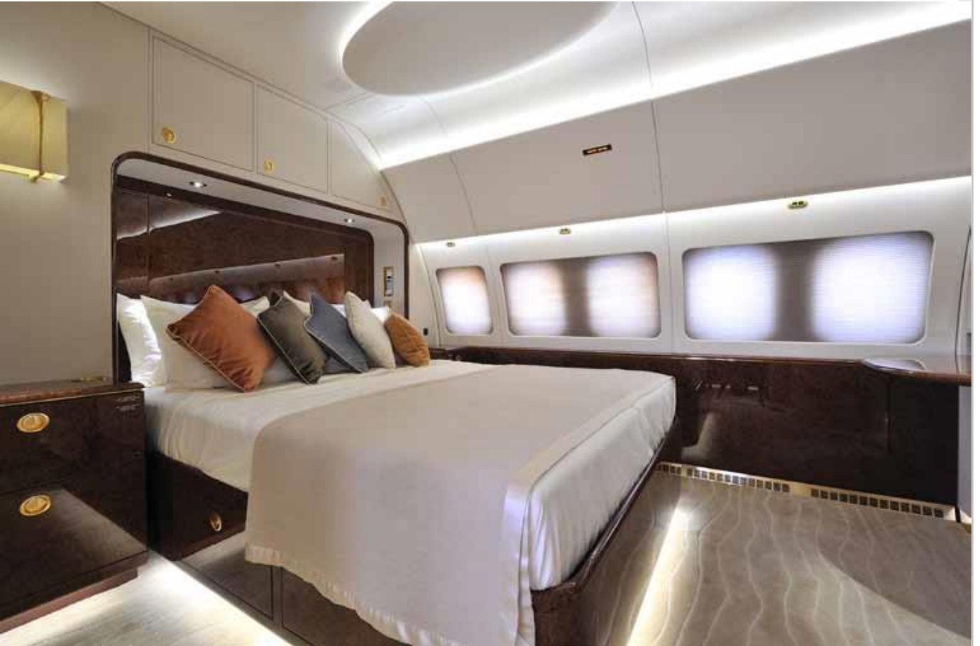
Forward Executive Bedroom