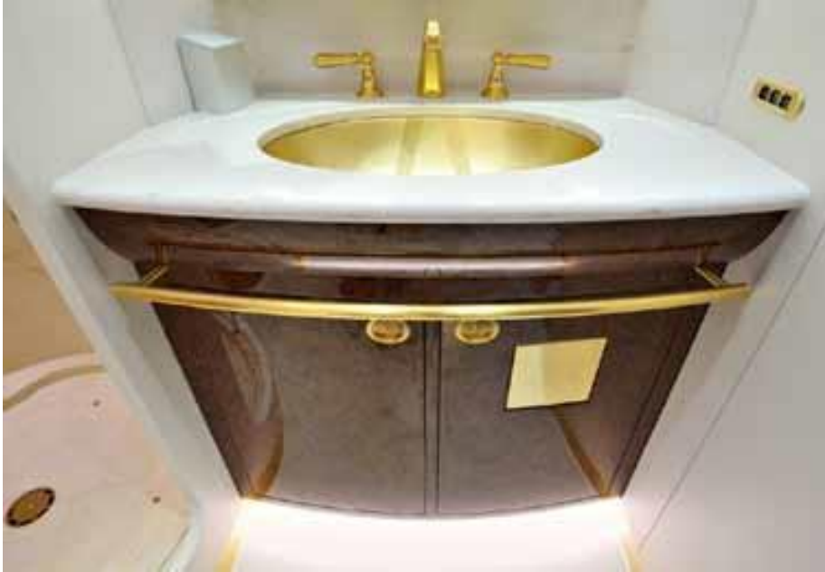
Executive Lavatory Vanity